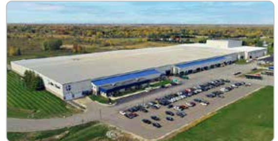
Pictured, the Alro Steel facility in Pottsville, Michigan