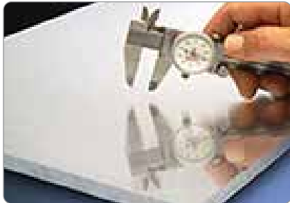
Our precision plate saws are capable of producing square cuts with tight tolerances.