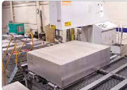
We also offer precision sawing of aluminum mold plate up to 30" thick.